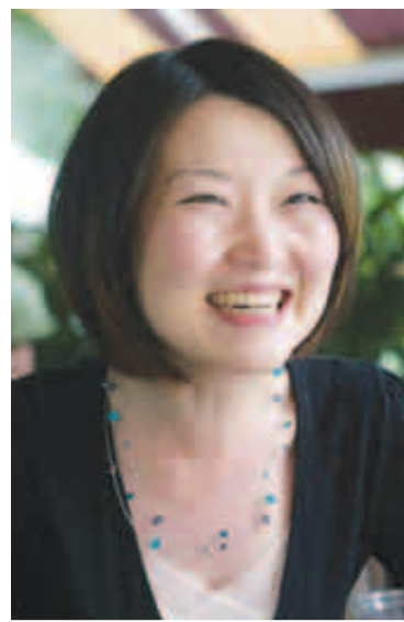
Paris B, My Women Stuff blog site and some beauty tips available on the site.