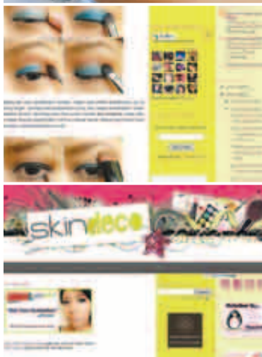
(from top) Cornelia De Alwis, Skin Deco blog site and some make-up tips available on the site.